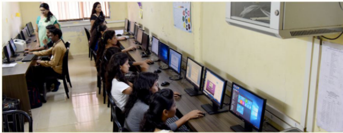
Computer Science Lab.